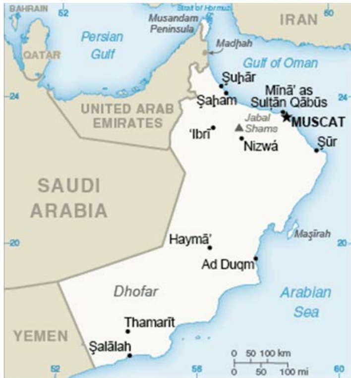
Figure 1. Map of Oman