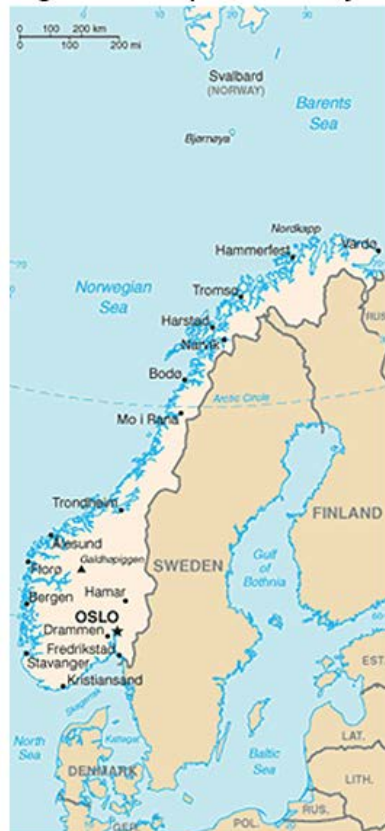
Figure 1. Map of Norway